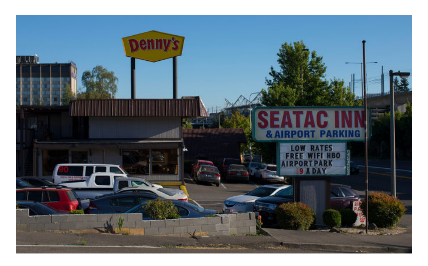
A Denny's restaurant and a motor inn will be neighbors to a new Hyatt under development in in SeaTac. Wash.

Higher pay, she said, often translates to lower employee turnover, as fewer employees leave to seek better-paying jobs. For employers, that means decreased costs for replacement hiring and training. Also, she said, the modestly higher prices that may result — for example in food concessions — are generally borne by customers.